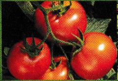
Fruits & Veggies