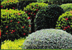
Trees & Shrubs