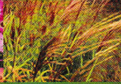
Grasses & Lawns