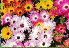
Plants & Flowers